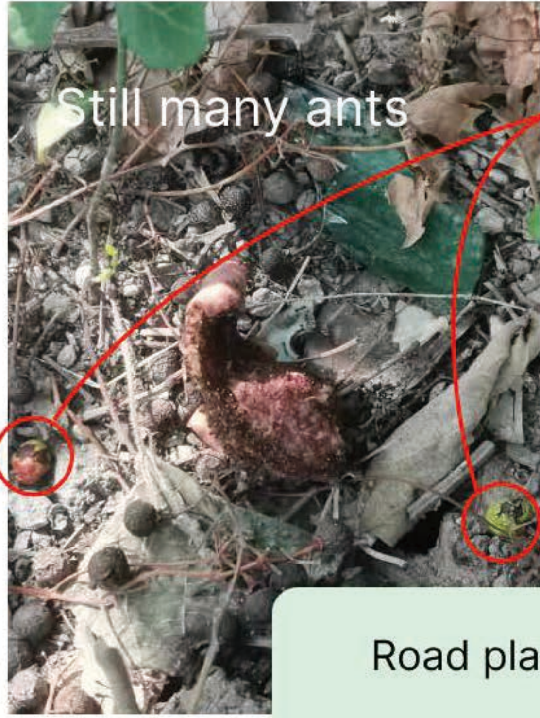
Still many ants

There were other kind of fruits near by, but the ants didn't choose to ate them?