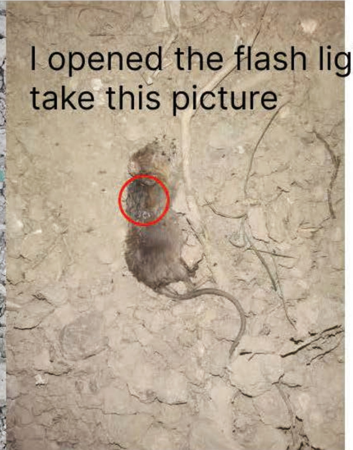
The mice started rotting