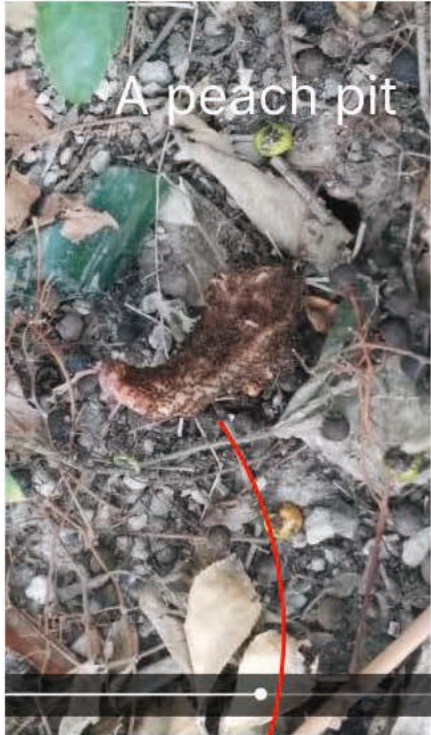
A peach pit