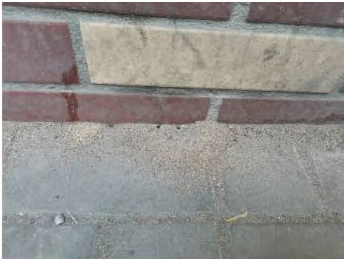
Entrance of ants' colony