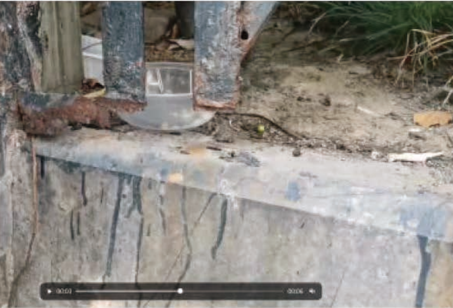
Ants (you can see them everywhere)