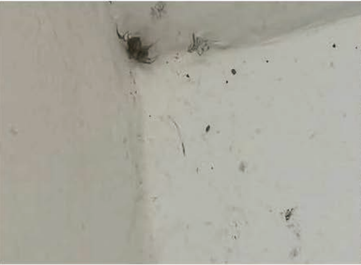
Spider and its net