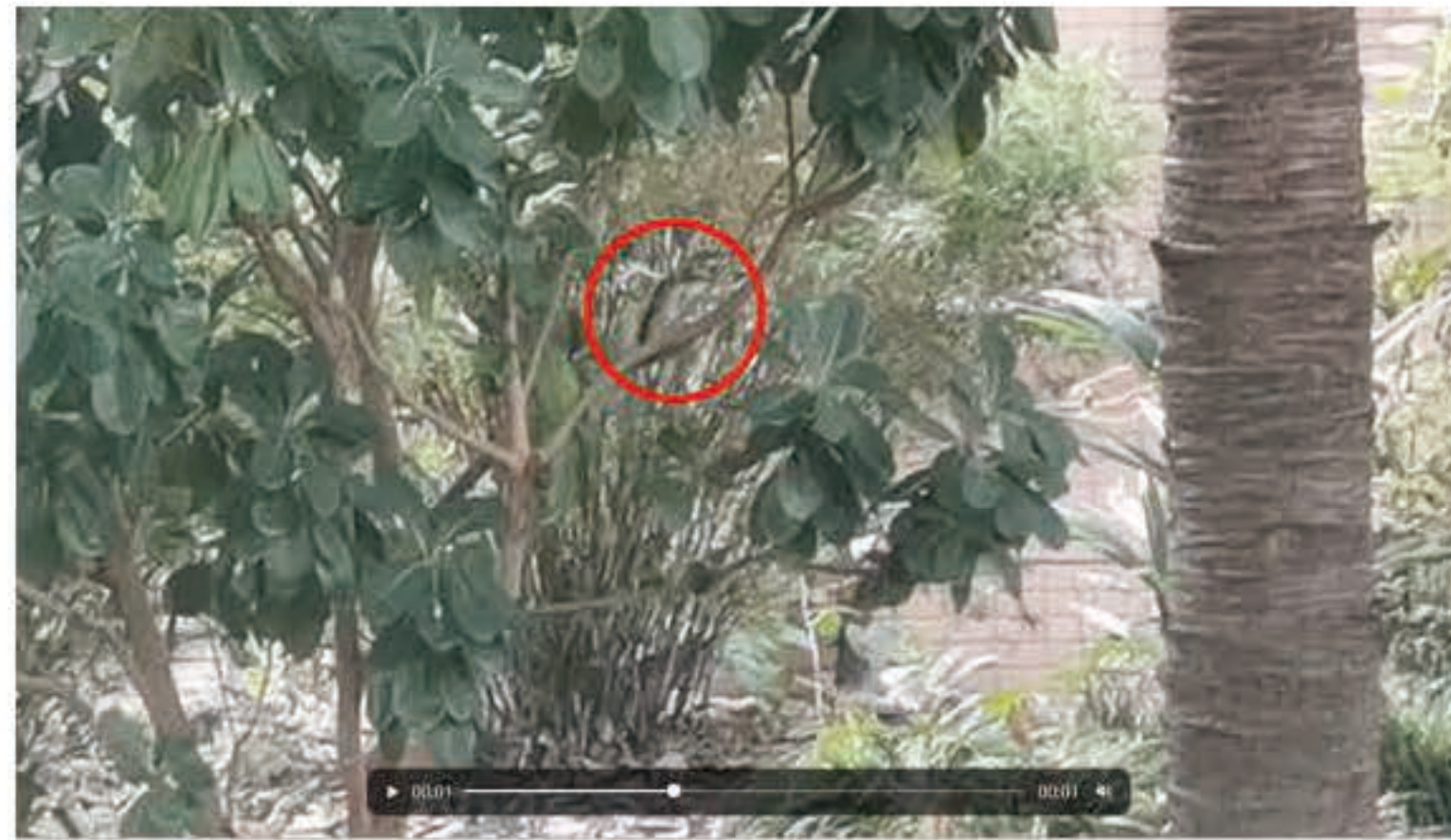
A bird here... I tried to go closer but scared her.