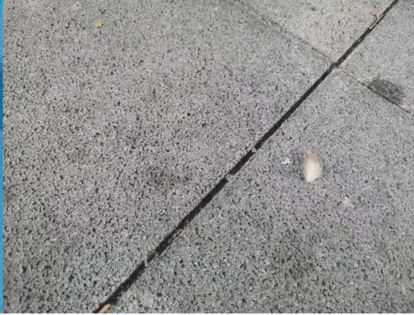
feathers not sure who is its owner