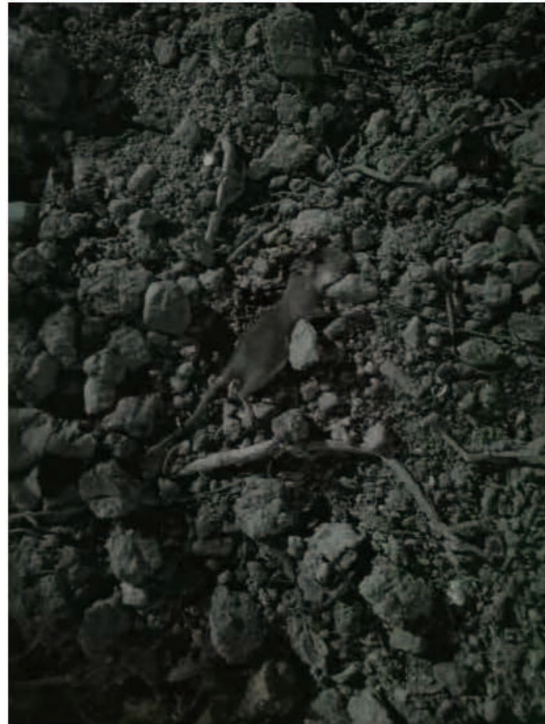
Looks a little bit disgusting