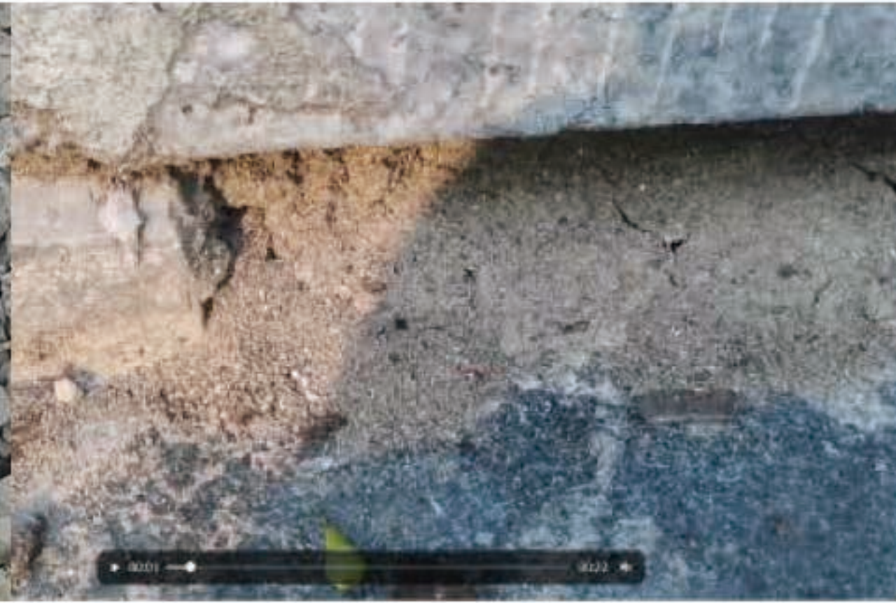
Entrance of ants' colony