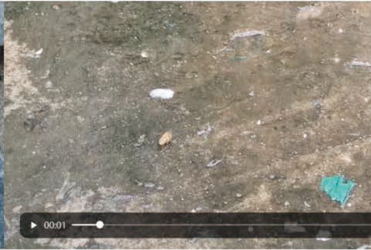
The first time I saw a bee on the ground