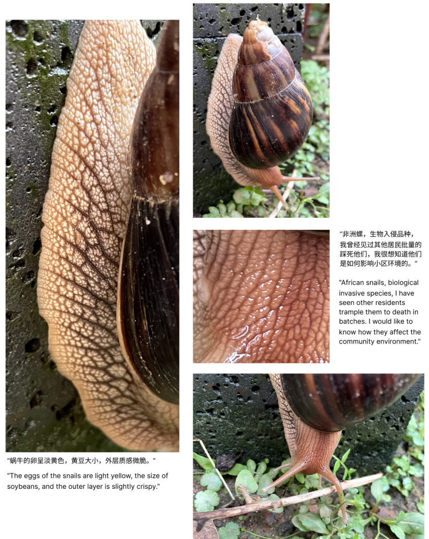
"蜗牛的卵呈淡黄色，黄豆大小，外层质感微脆。" "The eggs of the snails are light yellow, the size of soybeans, and the outer layer is slightly crispy."