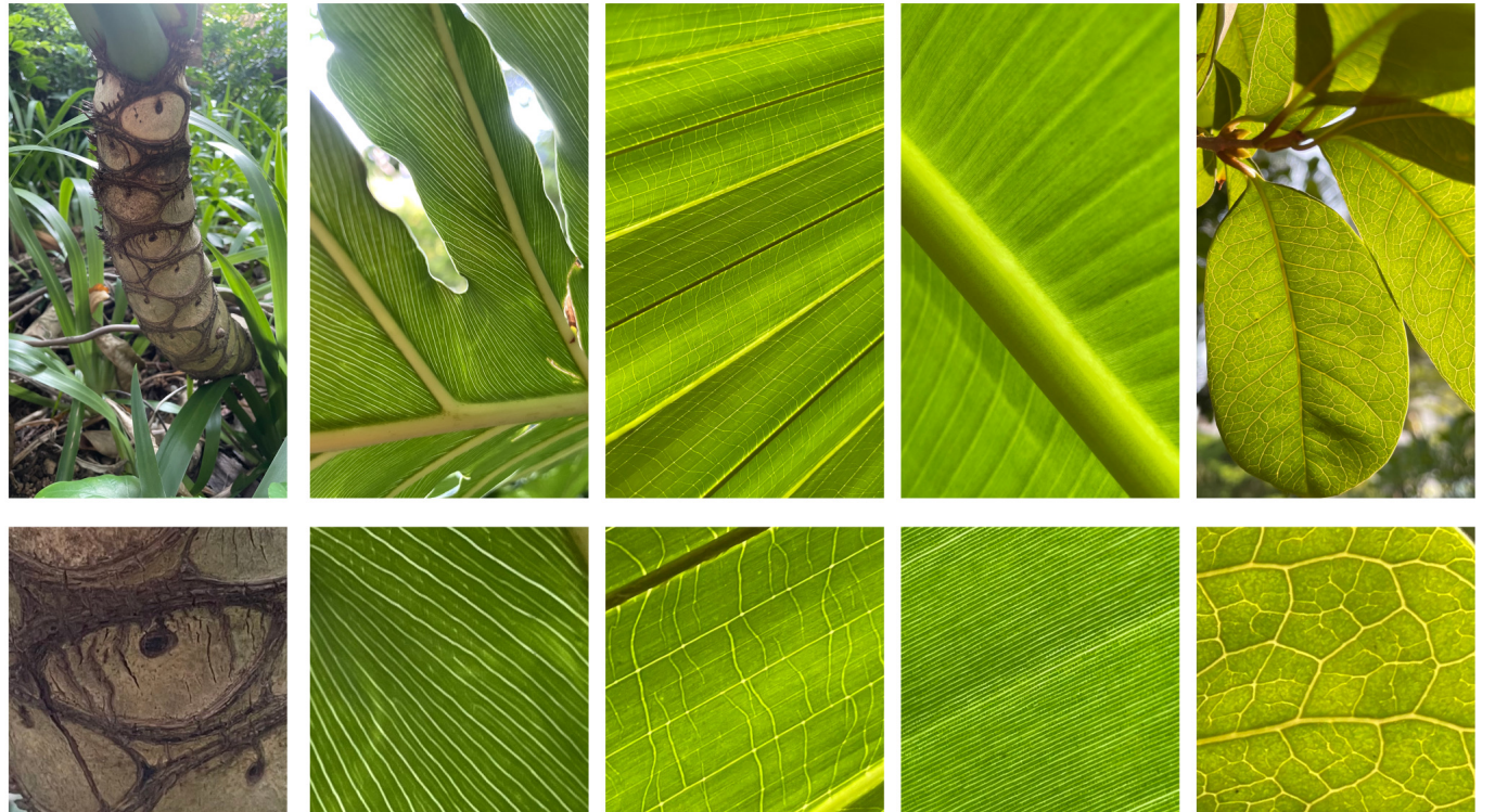
"透过阳光，叶子的纹路清晰可见" "Through the sunlight, the lines of the leaves are clear"