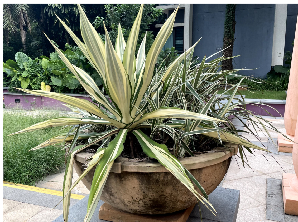
这是针对一盆植物的探索。我排斥这种将植物/自然禁锢与特定位置的行为。对横平竖直的追求刻录在城市建设的基因里。但自然却能将在混沌与规律结合在一起，创造出更高纬的美，例如叶脉的纹路。 This is an exploration of a pot of plants. I reject this behavior of confining plants/nature to a specific location. The pursuit of horizontal and vertical is inscribed in the genes of urban construction, but nature can combine chaos and law, creating a higher latitude beauty, such as the veins of a leaf.