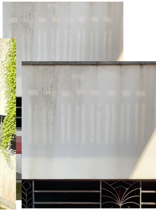
"Under the combined action of sunlight and water, the walls project the fluctuations of the water surface" Pictures can't show its beauty video I & II