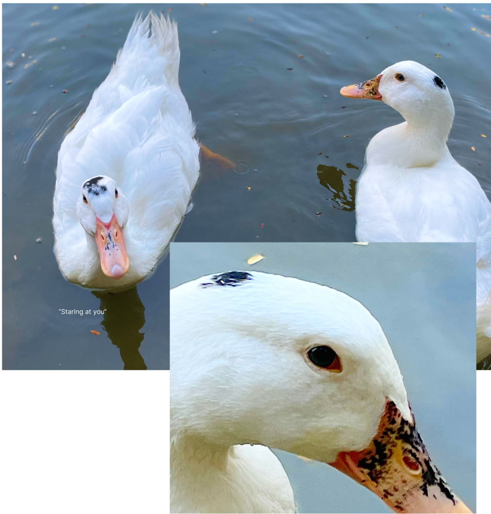
"Staring at you"