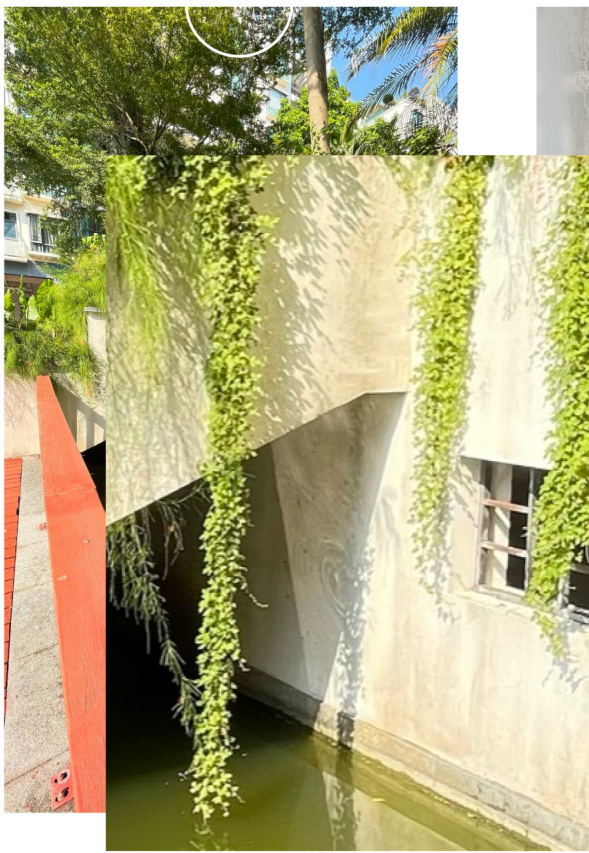
"在阳光与水的共同作用下，墙面投影出水面的波动" 图片无法呈现它的美 video I & II