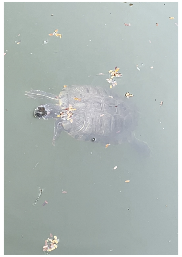
"巴西红耳龟，生物入侵品种，在湖里长得很好" Video III & IV "Brazilian red-eared turtle, an invasive species, thrives in the lake" Video III & IV