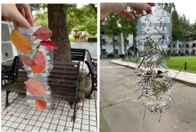
the process of making whatchamacallit inspire me to explore the nature in different perspective

I will spend more time in each location because of the difficulty in moving, sitting on a rock , feeling the coolness of the water, seeping into my pants, reaching out to touch the trunk , feel the speed of the water flowing on the trunk, hear the rain falling and slap on the raincoat due to gravity, and the amplified sound , feel the rhythm and speed of "dropping/falling"... As a person who did not like rainy days in the past, I also felt the peace & pleasant sensation of staying in the rain with cat in the park, which is a rare experience!